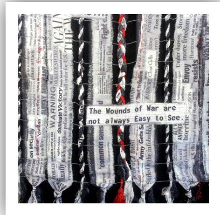
Free Lace Scarf (Detail)